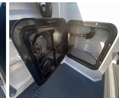
Top and Bottom Right: Standard access hatches allow you to access all plumbing.