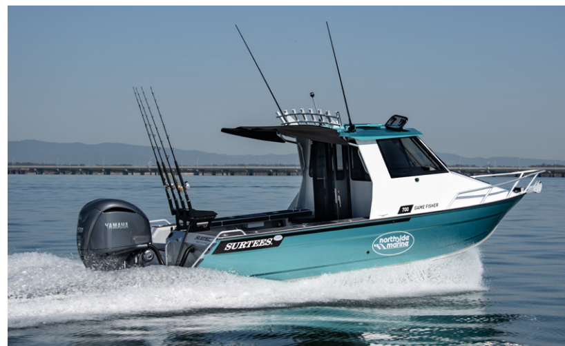
Main: There's no doubt that the Surtees 700 Game Fisher is a great looking rig. Above: It is fitted with Yamaha's Digital Electric Steering (DES) 250hp outboard, which is plug and play with Yamaha's Helm Master joystick and auto pilot system.

And it's not just the cool colour. New Zealand boats are typically very well-made and have all of the additions that a serious boater and angler would want. Northside Marine import these hulls and then add them to locally built