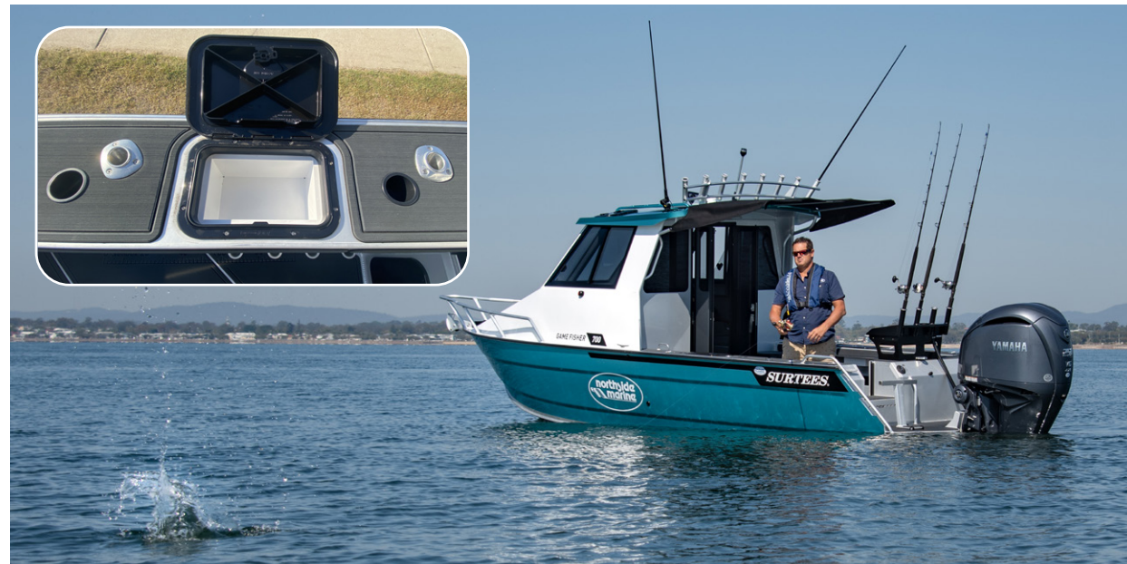
Above: All of the fishing space is in the cockpit and it's definitely built to handle water nastier than this. Inset: This is the first boat I've seen gunwale mounted boxes in. Brilliant for tackle storage that you need close to hand.

All of the workable fishing space in this boat is in the main cockpit and this is fully rubber lined – from the gunwales to the floor.