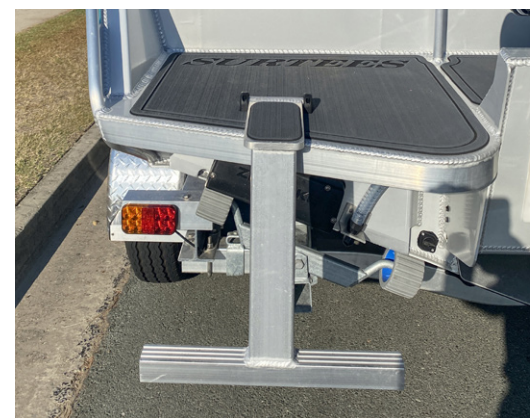
Top: Surtees treatment of the boarding step problem is sturdy, simple and convenient. Above: Plenty of room in here for the windlass.