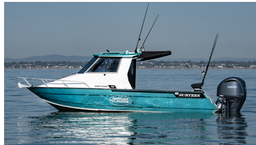
Top: Peak efficiency for this rig is at 3,700rpm where it delivers 1.6km/L at 43km/h. Punch the throttle and you get only 0.8km/L at 6,000rpm and 77km.h.

Forward of the cabin doors, the luxury continues. There is a sizeable cabin, which will allow multiple anglers to enjoy an overnighter,