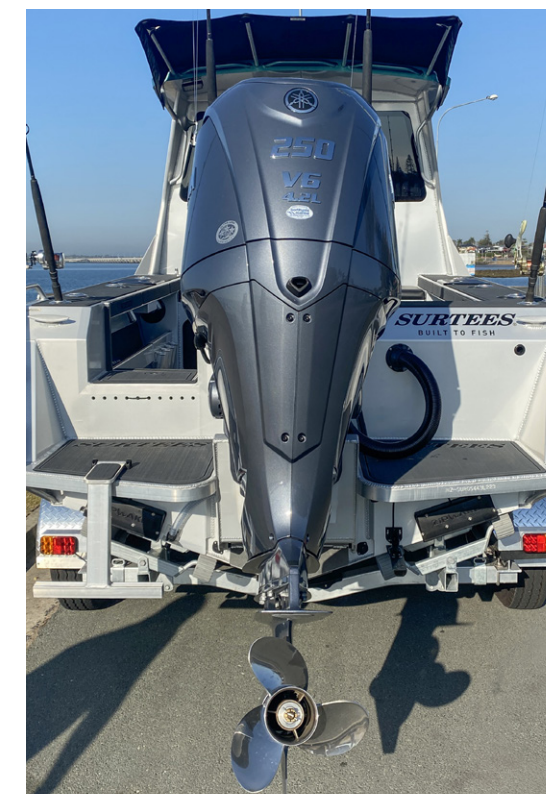
Yamaha's DES models have ultra-simple rigging and are available in blue or white.