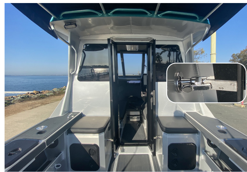
The pilothouse doors can be held open or locked shut, depending on the weather conditions.