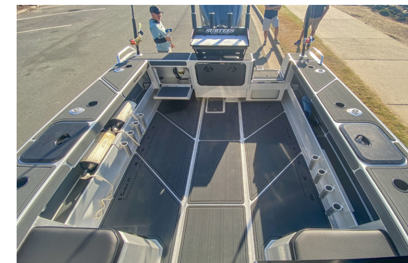
Now there's some cockpit space. Can you imagine fishing from this beast? Plenty of rubber decking and Nyalic coating where its unpainted aluminium.