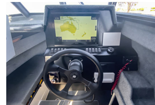
Top: We love the room for big, flush mounted MFDs at the helm. The Surtees helm is custom built to hold everything you'll want to fit – including the rest of the Helm Master options if you want them. Above: Big windows that open from the front help air circulation massively.